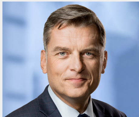
JAN E. JØRGENSEN

Political Leader of Venstre in Copenhagen Mayor of Labour Market and Integration in the City of Copenhagen